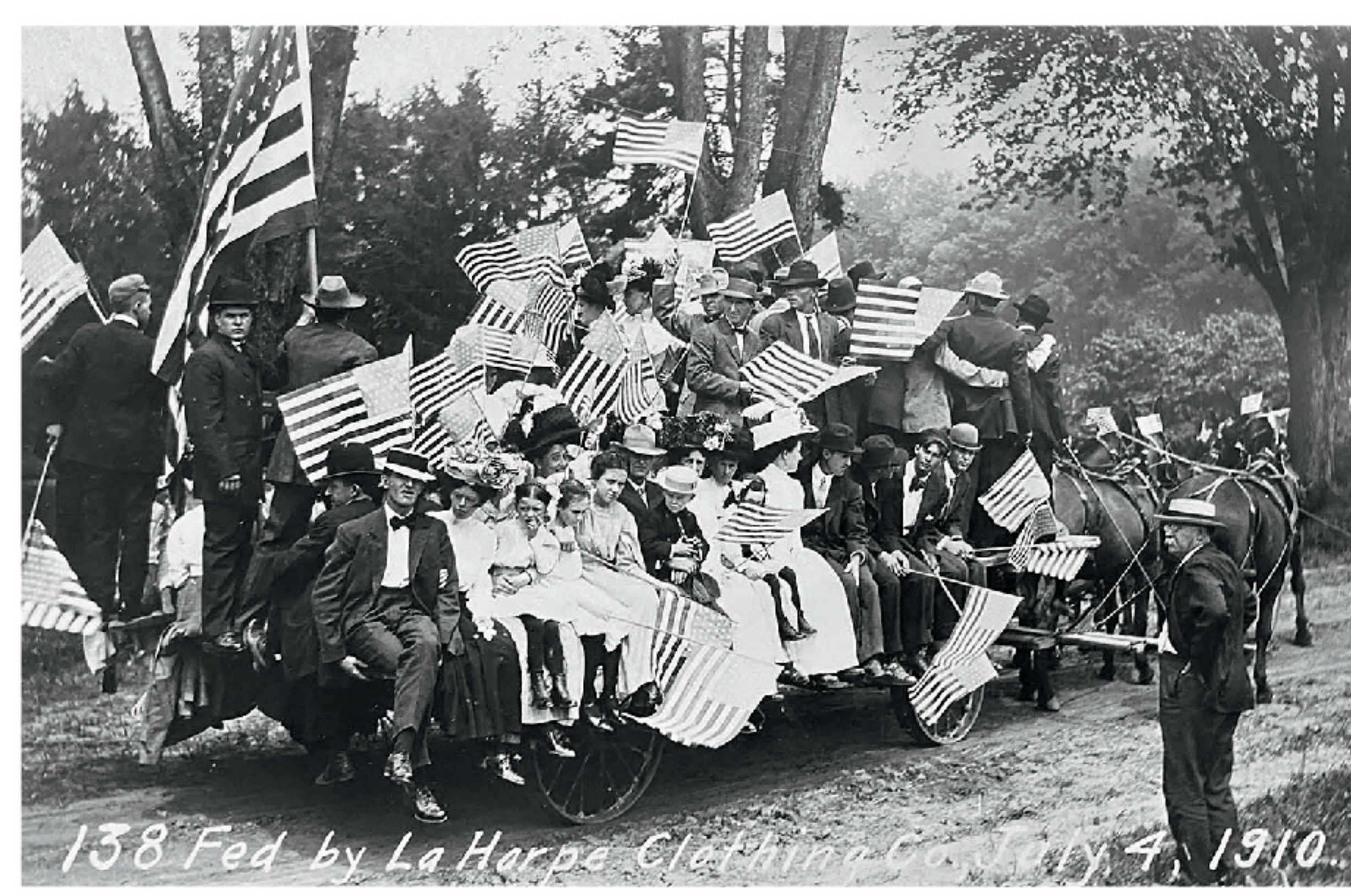
La Harpe Fourth of July parade float (1910)

ENJOY A VARIETY OF HAPPENINGS CELEBRATING THIS MILESTONE IN 2025!