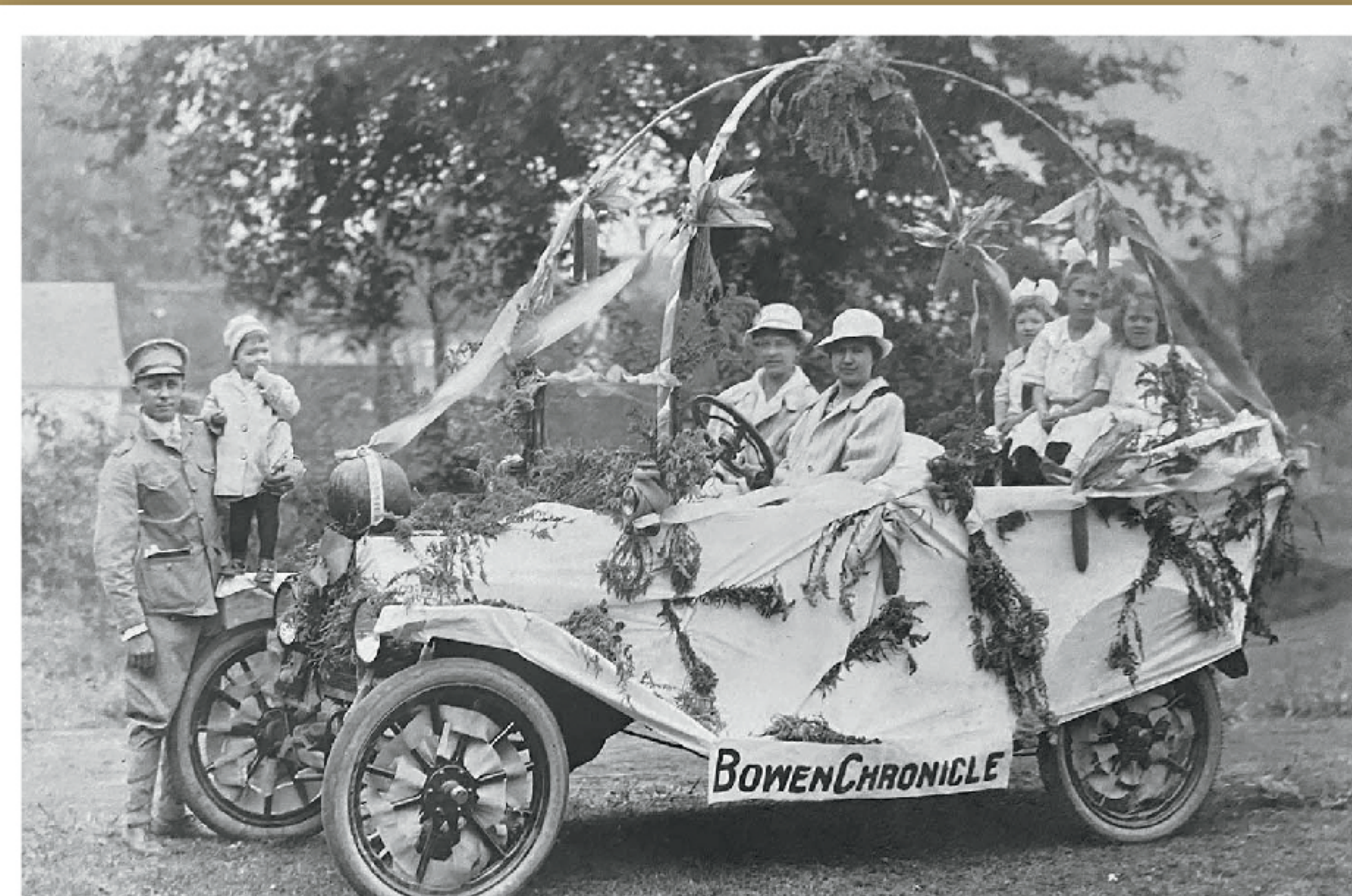
Bowen Chronicle parade float at the Bowen Corn Carnival parade (circa 1914).

Events and times are subject to change. Scan the code above or follow us on Facebook for the latest updates.